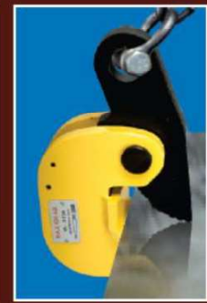
PLATE GRABS & DRUM LIFTER

Lifting clamps designed according to EN13155. Lift, lower and position with complete safety.