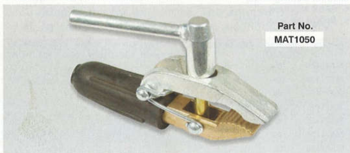
Part No. MAT1050