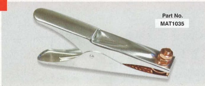
Part No. MAT1035