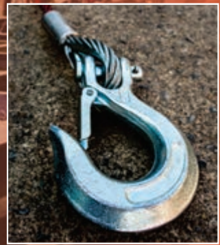
Order hook & cable separately