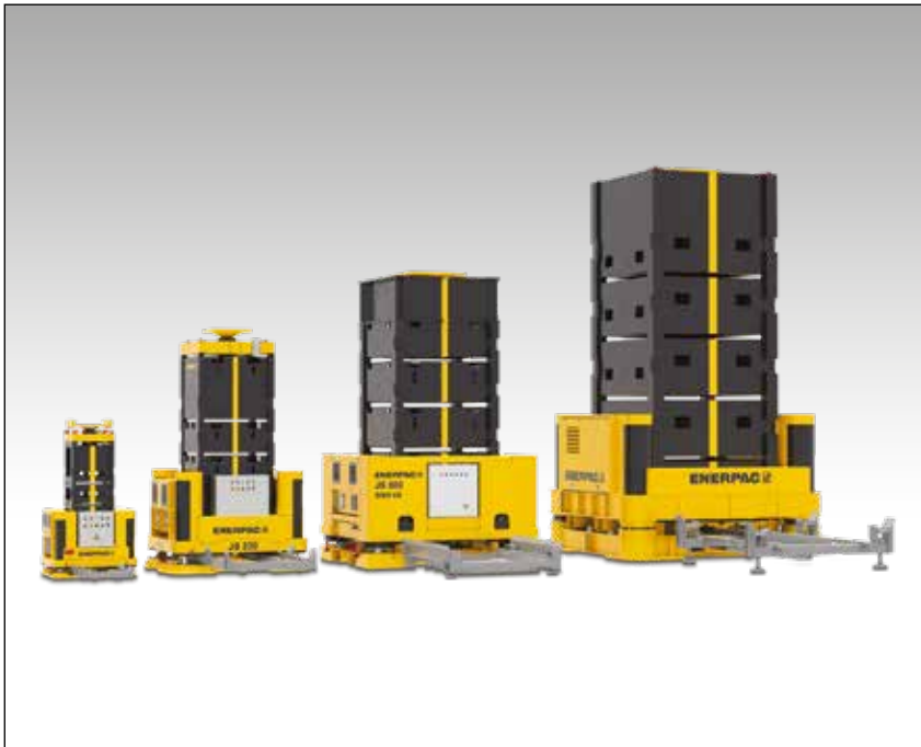
▼ JS125, JS250, JS500, JS750, Enerpac Jack-Up System (one lifting tower shown)