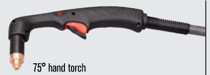
75° hand torch

(for more torch options, see www.hypertherm.com )