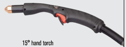
15° hand torch